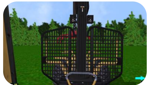
Unloading logs from the forwarder cradle to a target on the ground